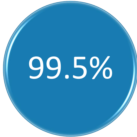
On Time, In Full Delivery