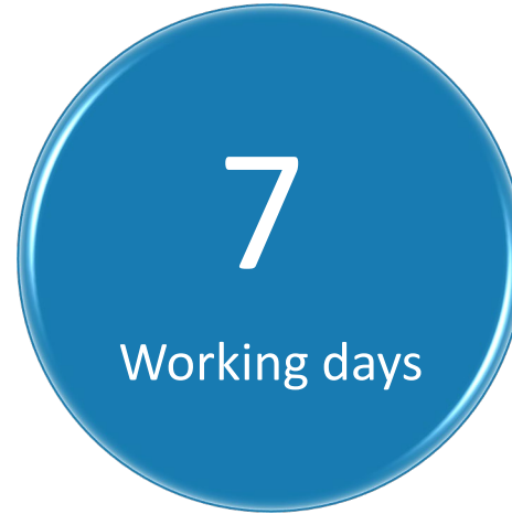
Customer Complaint Resolution