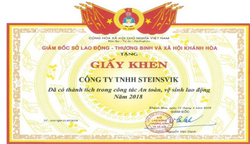
Safety Award from Authority